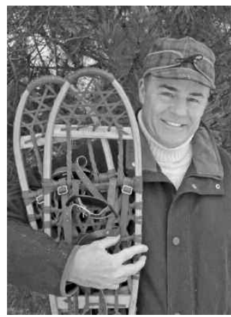
Stormy Kromer caps and classic Iverson snowshoes are Michigan made

(landtrust.org). • Baabaazuzu Bundle-Up: Before venturing with the family to ski, board, or sled at Petoskey's Winter Sports Park, Charlevoix's Mt. McSauba, or Boyne City's Avalanche Mountain detour to Grandpa Shorters in downtown Petoskey