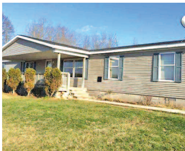
11340 DETOUR ROAD • ELLSWORTH

Nice 4 bedroom 2 bath newly updated home with a 2 car detached garage on 10 acres. This home is located between East Jordan and Ellsworth on a quiet country road. The home has a large porch area where you can sit and enjoy the serene surroundings and watch the wildlife. This would be a great home for a family looking for a peaceful location and is looking for a move in ready home. MLS #446800. $124,900. Ask for Mike Stark or Holly Nierman