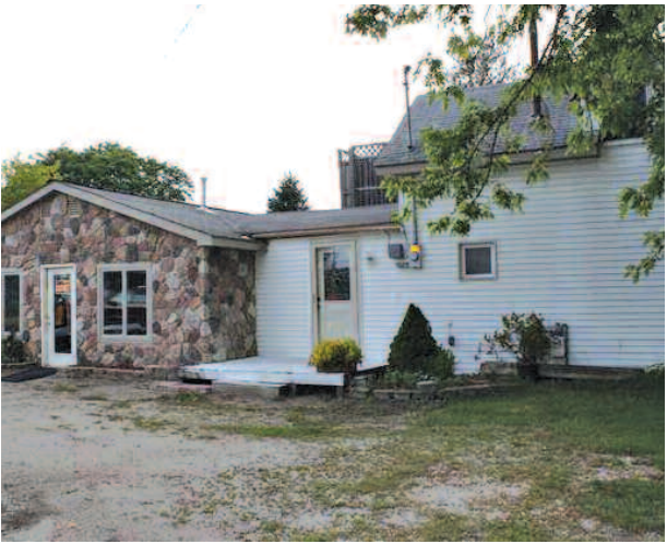
401 WATER STREET • EAST JORDAN