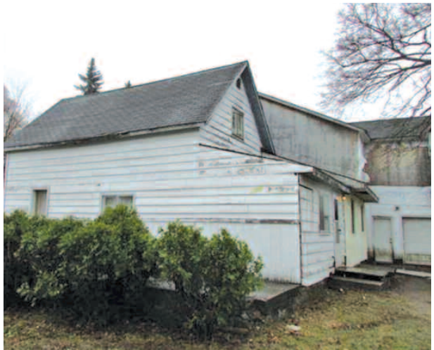
1015 WATER • EAST JORDAN