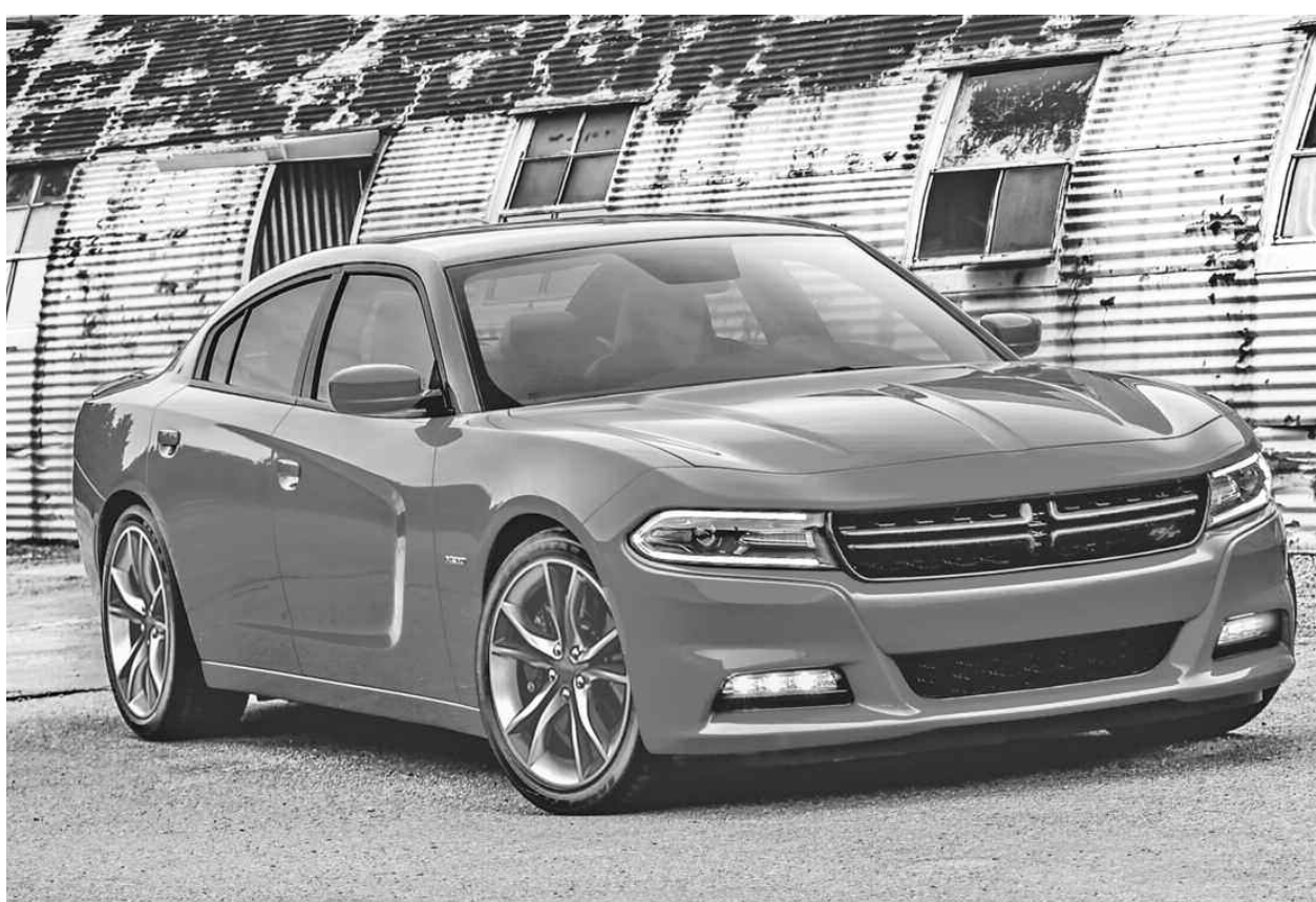
For the second time in two years, Dodge Charger has earned the Residual Value Award in the "Full-size Car" category from ALG, the industry benchmark for residual values and depreciation data.