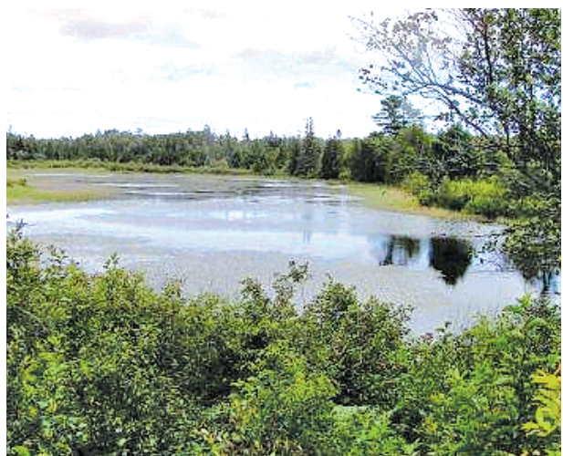
SIX MILE LAKE ROAD, EAST JORDAN